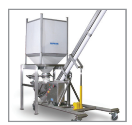
Mobile Base and Bulk Hopper