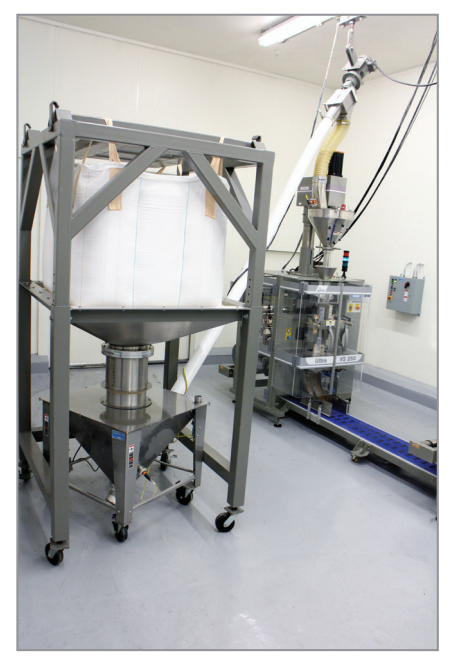
Hapman's Helix Flexible Screw Conveyor installed at the Guixens Food Group Facility in Tampa, Florida.

Here are just a few examples of the cost-effective ways the Helix is used in practice.